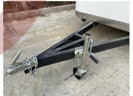
- Tow Bar -