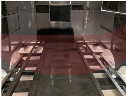
- Trailer Chassis -