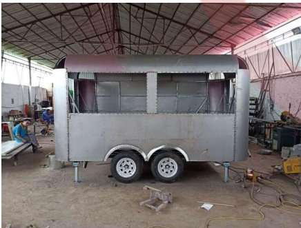
- Production -