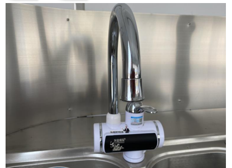
- Tap -