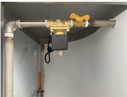
- Gas Piping -