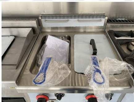
- Deep Fryer -